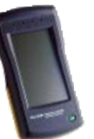
The new One Touch Network Assistant

For more information on the entire Fluke family of network maintenance tools, or a copy of the executive summary of the new Infonetics study on the 7 Best Network Maintenance Practices , call 1-800-44-FLUKE today.