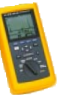
DSP-100 digital cable tester

For example, our Enterprise LANMeter with SwitchWizard option, the first portable network management device that lets you see inside switches. The DSP-100, the world's first digital cable tester. And our new One Touch Network Assistant for front-line troubleshooting and Fast Ethernet cable testing.