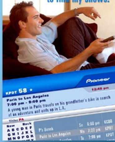
Pioneer Digital Television (2005 NCTA Show - San Francisco)

"With Advanced Title Search, Passport DCT makes it easy to find my shows."